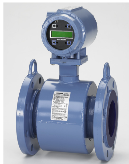
The Rosemount 8732 flowmeter

By using meter verification diagnostics, the customer eliminated flow lab costs, maintenance costs, and shipping costs.